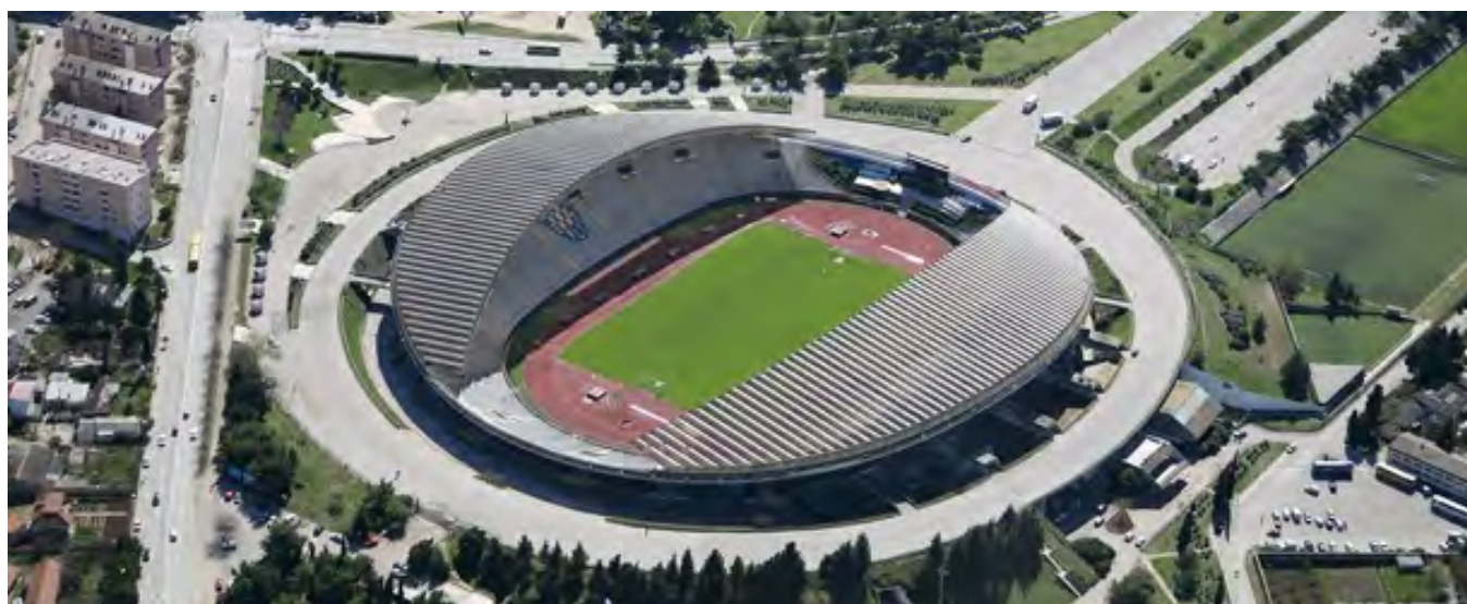
Poljud Stadium, Split Croatia, LEXAN™ THERMOCLEAR™ Sheet installed in 1979!